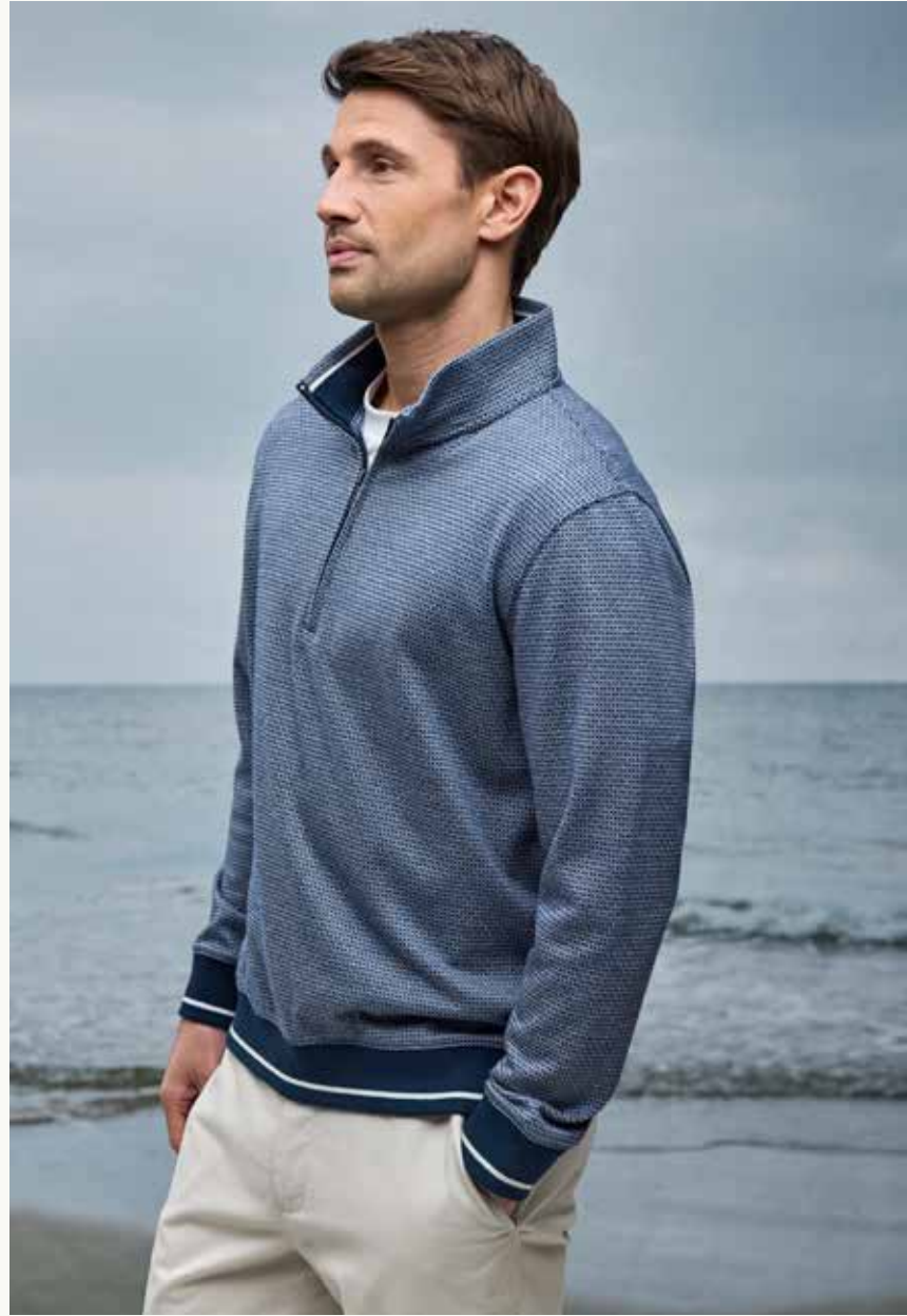
Casual Top 55389/78, Chino 71400/91