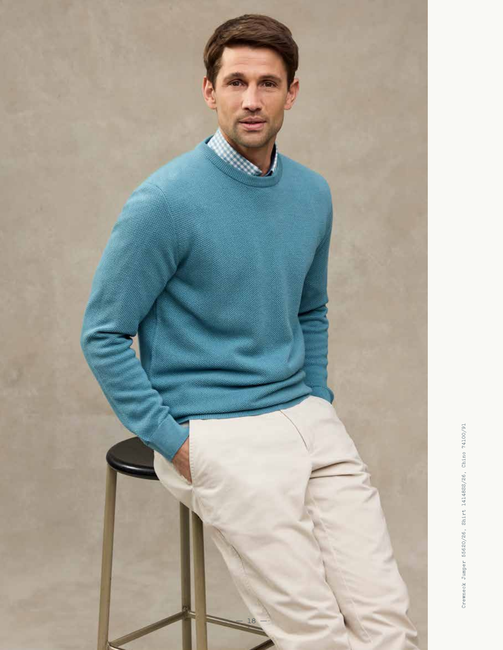
Crewneck Jumper 55620/26, Shirt 14148SS/26, Chino 74100/91