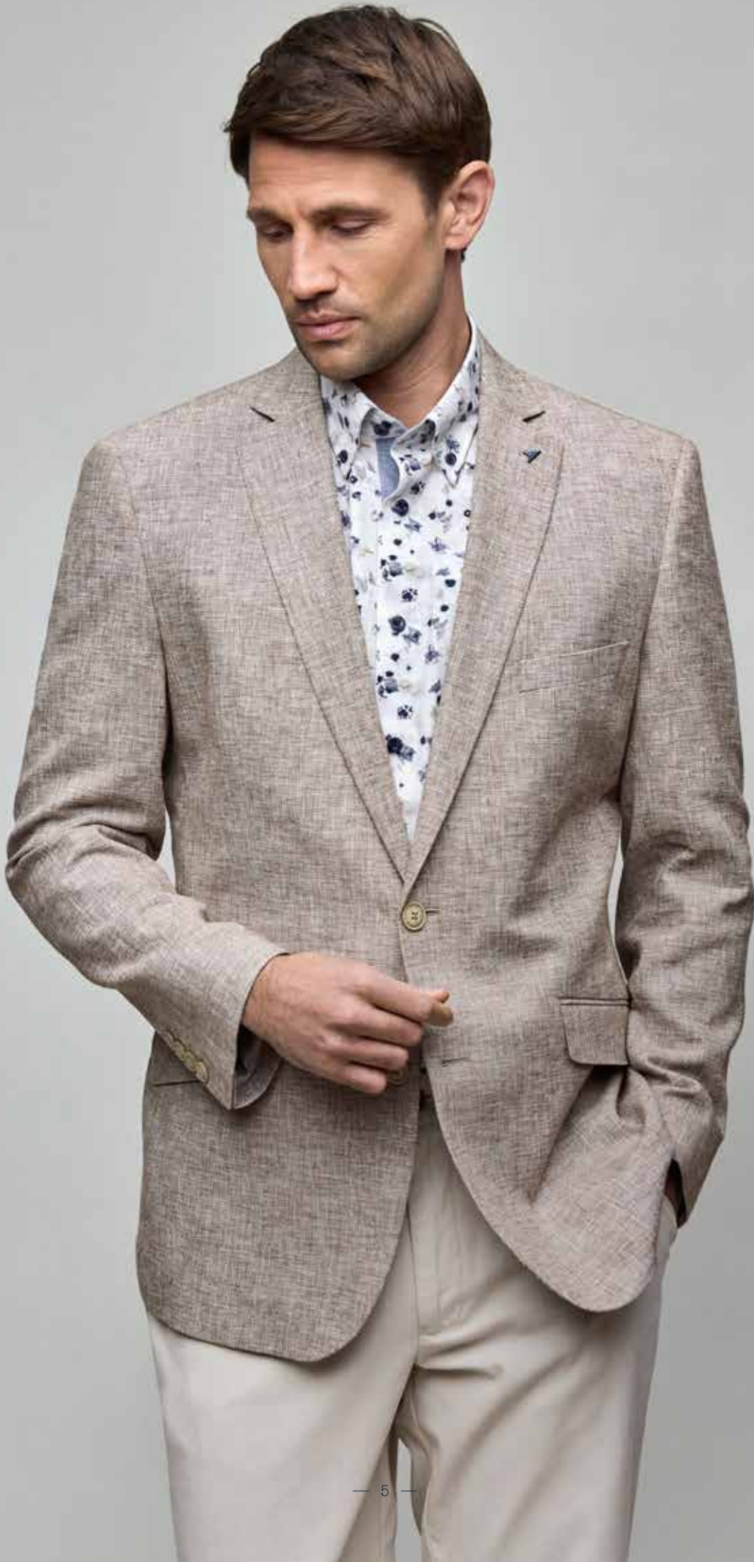
Jacket 14501/94, Shirt 14133SS/18, Chino 74100/91