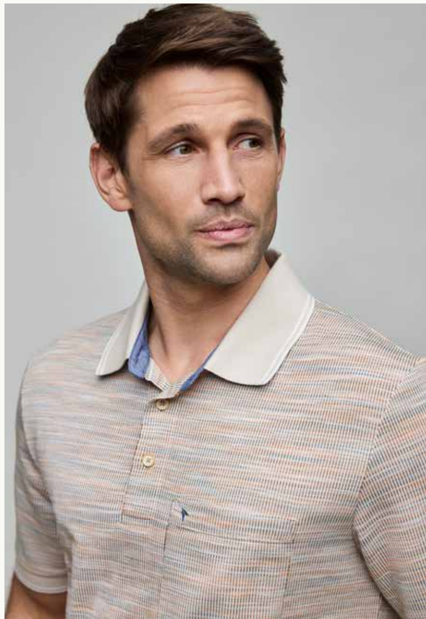
Shirt 14030SS/24, Shorts 64100S/26